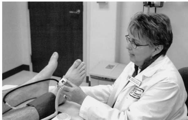
Figure 1. For the ABI test, a nurse measures the blood pressure in the ankle of a patient using a handheld ultrasound device. The ABI is determined in each leg, and the results are used by a doctor to diagnose PAD.

Claudication is a sensation of aching, burning, heaviness, or tightness in the muscles of the legs that usually begins after walking a certain distance, walking up a hill, or climbing stairs, and goes away after resting for a few minutes. The ache can be felt in the buttocks, thighs, or calves. In some patients, particularly patients more than 70 years old, the feeling of claudication may be different from this classic or textbook description (such patients are said to have atypical symptoms). Your doctor must distinguish leg pain due to claudication from other causes of leg pain, such as painful joints (arthritis), tingling or a “pins-and-needles” sensation (neuropathy), and pain running down the back of the thighs due to arthritis of the spine (sciatica or spinal stenosis). Your doctor will be able to distinguish claudication from other types of leg pain on the basis of your description of the symptoms and a thorough physical examination. Sometimes it is difficult to determine the specific cause of the leg discomfort, or you may have more than one problem, so your doctor may order additional tests, which are discussed below. Patients with severe PAD may have claudication after walking a short distance or may have pain in the legs or feet when at rest or when lying in bed at night. In severe cases, patients may develop a sore (ulcer) that will not heal on its own or