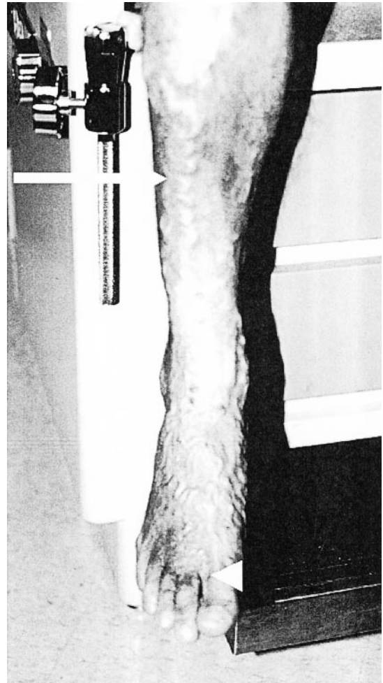
Figure 1. Varicose veins. This photo shows a case of severe varicose veins. The long arrow points to a meandering, snake-like, large varicose vein in the front of the calf. The arrowhead indicates an area of inflammation (redness, warmth) where episodes of bleeding have occurred.

Although most patients see a physician for the poor cosmetic appearance of varicose veins, they can also experience symptoms of burning, aching, or itchiness. Symptoms tend to be less severe in the morning after a night of leg elevation in bed and worsen through the day with standing. Occasionally, without proper care, varicose veins may